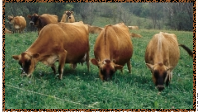
Organic livestock must be fed 100 percent organic feed and hay.

and vegetables) to ensure a healthy system (see “Soil Health” section, page 9). A typical six-year rotation in Iowa is corn (with a cover of winter rye)-soybeans-oats (with an underseeding of alfalfa)-alfalfa-corn-soybeans. Horticultural crops should be rotated with a leguminous cover crop at least once every five years to enhance soil quality.