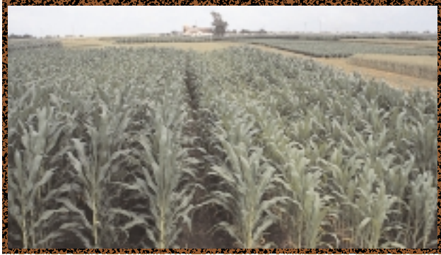
Organic crops are required to be grown in rotations, as demonstrated by the corn-soybean-oat-alfalfa rotation, shown at the I.S.U. Neely-Kinyon Farm.