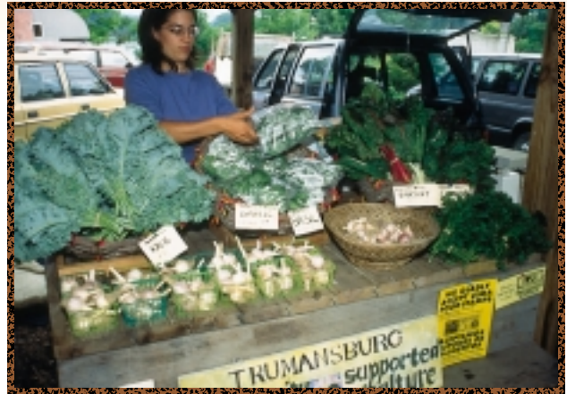
Farmers markets offer opportunities for small- and large-scale operations.

Although the organic industry began as a niche market, steady growth has led to its place as a segment market since 1997.