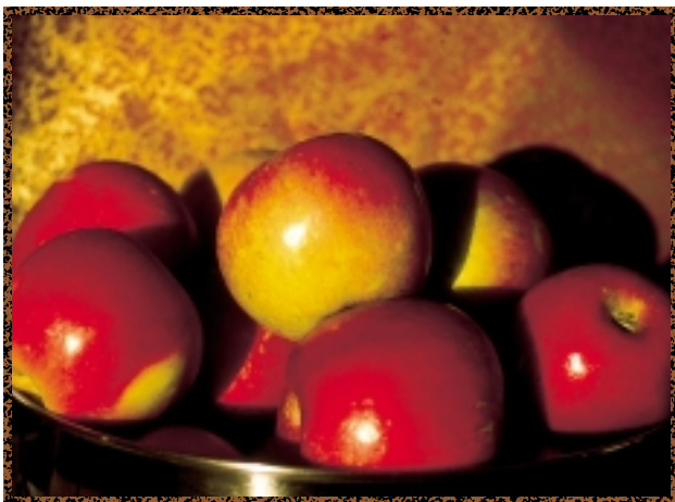
Unblemished organic apples can be grown when growers employ rigorous pest management practices.

Organic apple production represents one of the most intensively managed organic systems.