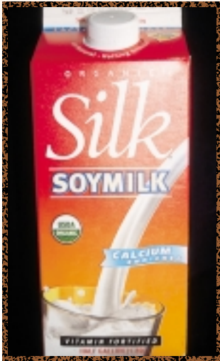
The new USDA organic label appears on all certified products in the U.S.

Added water and salt are not counted as organic ingredients. The use of the USDA Organic Seal can only be used on the 95% and 100% organic products.