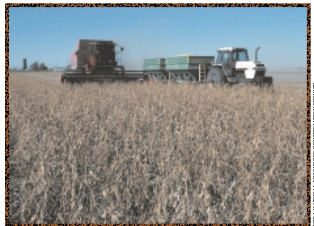
Harvesting and storing organic soybeans are important steps in collecting a premium price.

Many buyers require a sample of soybeans prior to accepting a load. Soybeans will be screened