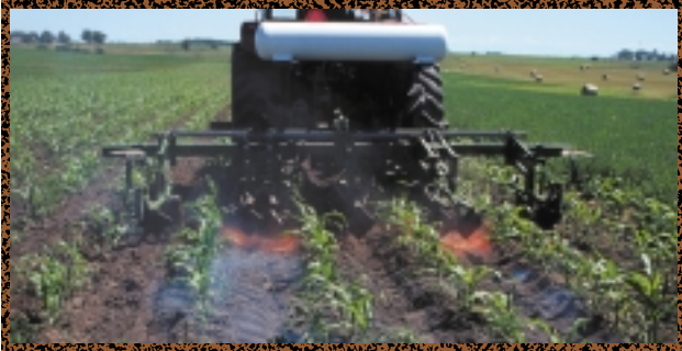
Propane flame burners can be used on organic farms to control weeds between and within rows.