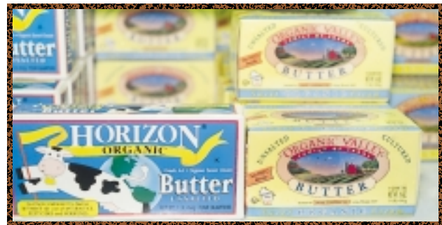
Products labeled as “organic” meet strict legal requirements, including certification by a third party.

Though the term “organic” is defined by law (see “Legal” section on pages 3 and 4), the terms “natural” and “eco-friendly” are not. Labels that contain those terms may imply some organic methods were used in the production of the foodstuff but do not guarantee complete adherence to organic practices as defined by a law. Some products marketed as “natural” may have been produced with synthetic or manufactured products (those not considered to be “organic”), such as “natural beef.” While eco-labels are encouraged for producers interested in lowering synthetic inputs and farming with ecological principles in mind (biodiversity, soil quality, biological pest control), eco-labels are not regulated as strictly as USDA organic labels.