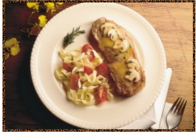
Organic produce has become a more visible menu item at restaurants around the world.

Worldwide consumption of organic products has experienced tremendous growth, often surpassing the U.S. figures of 20 percent annual gain. Much of the increase in worldwide consumption has been fueled by consumers' demand for GMO-free products. Because GMOs are disallowed in organic production and processing, organic products automatically are designated as GMO-free at the marketplace. European consumers have led the demand for organic products, particularly in countries such as the Netherlands, Italy, and Austria. Two percent of all German farmland, four percent of Italian farmland, and 10 percent of Austrian farmland is managed organically. Prince Charles of England has developed a model organic farm and has established a system of government support for farmers making the transition to organic production. Major supermarket chains and restaurants in Europe and the United States offer a wide variety of organic products in their aisles and on their menus.