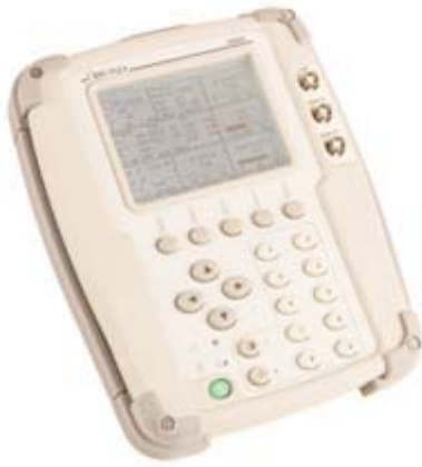
The 3515AR Series test set is a hand-held radio tester capable of direct connect and over the air testing from 2-1000 MHz.

Lua is an open-source scripting language created in 1993 at the Pontifical Catholic University of Rio de Janeiro, Brazil. Because it is written in C, Lua has fast execution speeds, requires very little storage space, and easily meshes with other C and C++ code. The fact that Lua meshes so well with C and C++ makes it an excellent “glue” language to bind systems together. It is used by many different applications, primarily for scripting. Its fast execution speed, small storage requirements, and relative ease of development make it an excellent choice to use as the basis for the 3515AR Series scripting language.