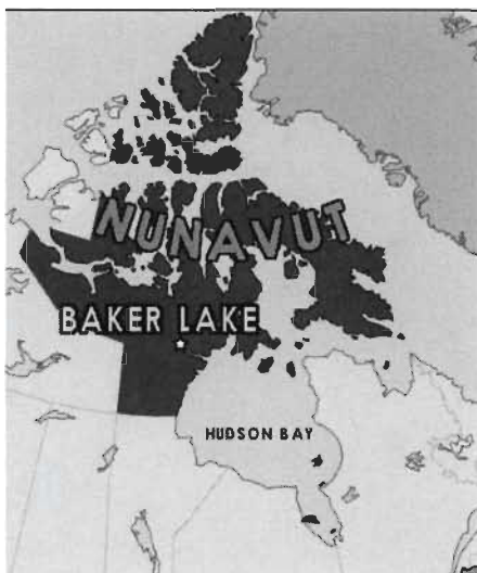
Figure 1.1 : Carte du Nunavut montrant la localisation de Baker Lake. Modifié de http://commons.wikimedia.org/wiki/File:Canada_%28geolocalisation%29.svg .

(Fox 2003) que pour l'écologie végétale (Krebs 1963; Svoboda & Staniforth 1998; Levasseur 2007). Baker Lake est un site ITEX depuis 1992, une étude à long terme initiée par Dr Josef Svoboda et poursuivie par Lucie-Guylaine Levasseur en 2005.